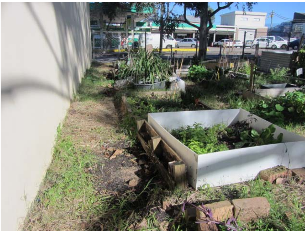
Photo 8: The 1m buffer zone for spraying of cockroaches has been completed in May 2012