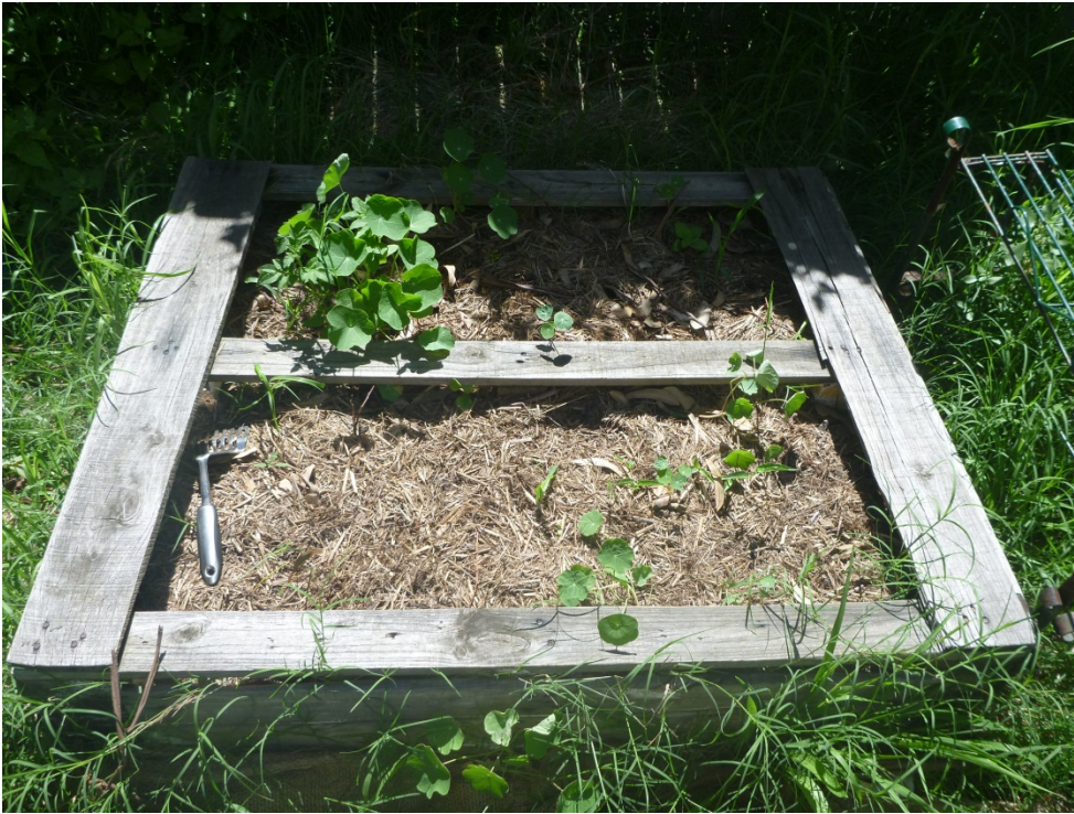
Photo 7: Garden beds are mainly used recycled timbers which can contain copper chromate arsenate May 2013