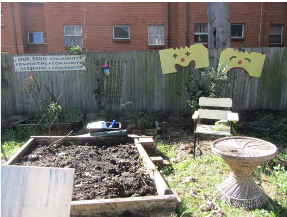
Photo 12: Garden soil has been donated by local residential excavations, May 2012.