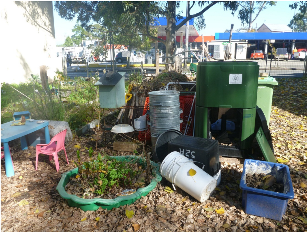
Photo 14: Garden materials which have been placed onsite, May 2013