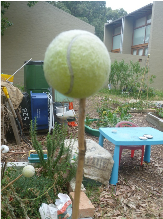
Photo 6: The group has placed tennis balls on bamboo stakes at eye level, July 2013