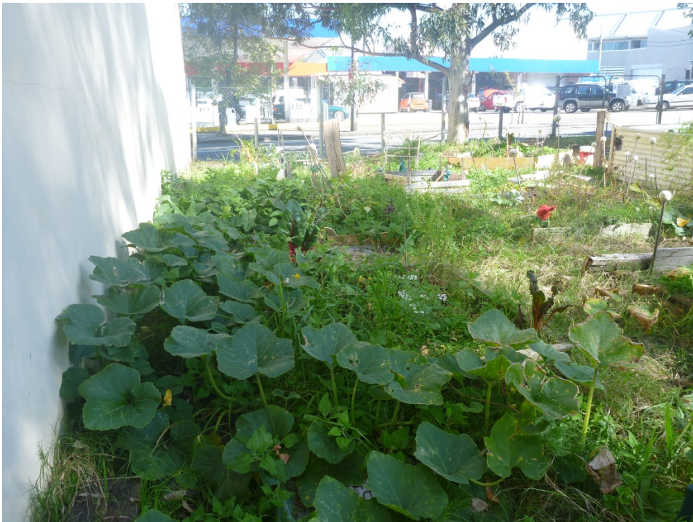
Photo 9: The 1m buffer zone for spraying of cockroaches has not been maintained by group, since November 2012. Produce crops are growing within sprayed target area.