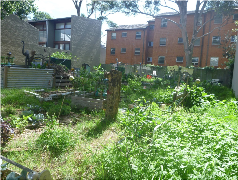
Photo 11: Pathways and access around garden beds is overgrown by produce plants and weeds, May 2013, which can become a trip hazard.