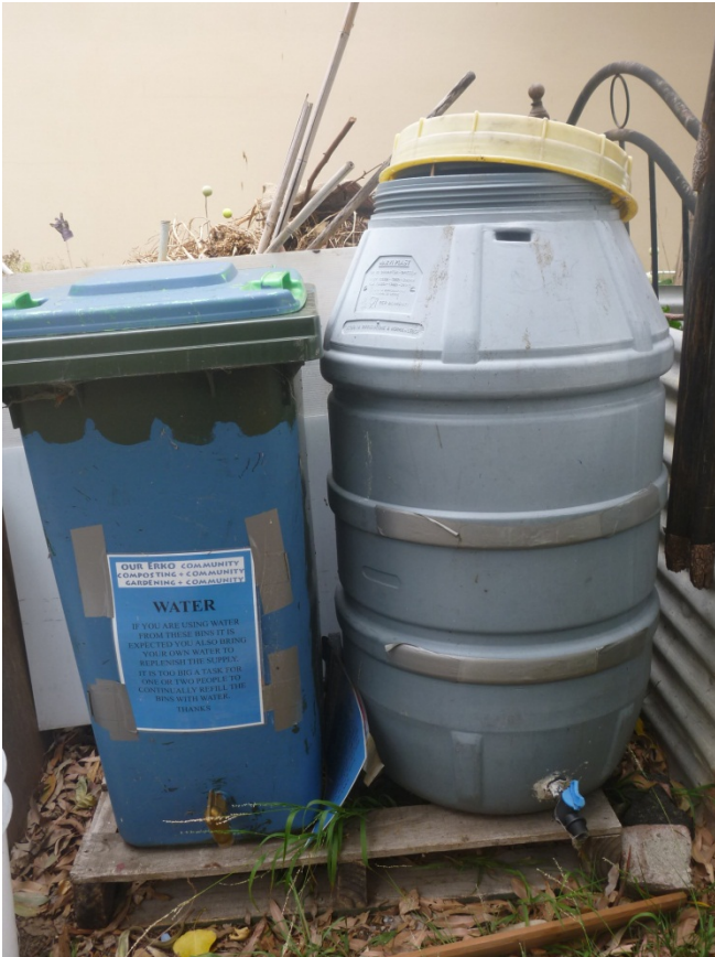
Photo 13: Water containers are filled up by buckets from BP service station across the road, November 2012.