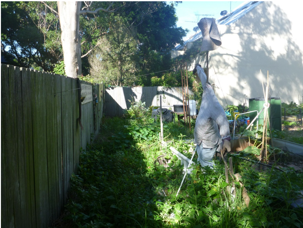
Photo 10: Site has not been maintained to reduce weeds since November 2012. This overgrowth can encourage cockroaches and vermin.