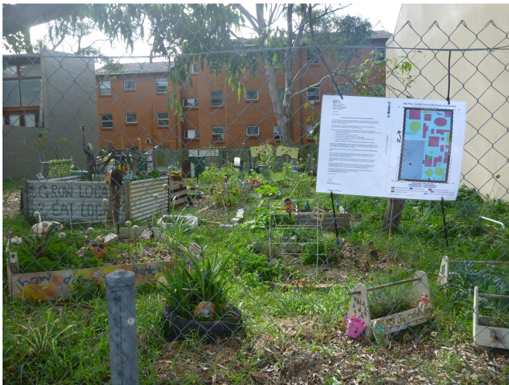
Photo 4: The condition of the garden during the Community Consultation