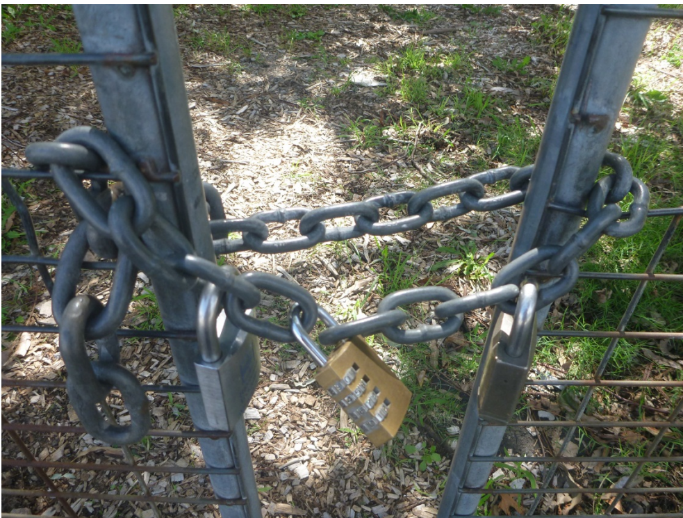
Photo 16: Supplied combination lock for access for the gardeners and Council, May 2012