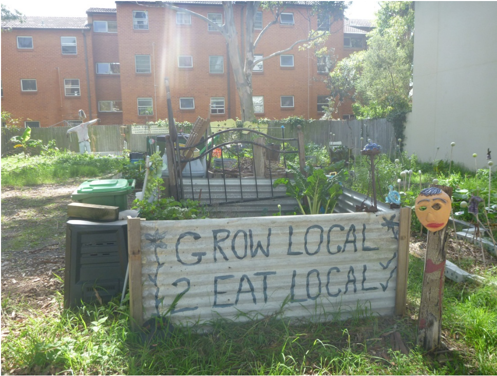
Photo 15: Group has placed timber edge on sides of garden to reduce sharp edge of tin, July 2012